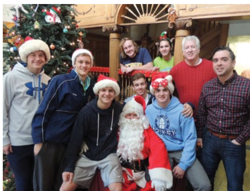
SLUH Hockey Team at the Taylor Family Care Center