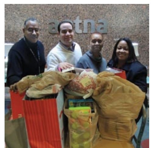
Aetna donated many Cookie Jar gifts!