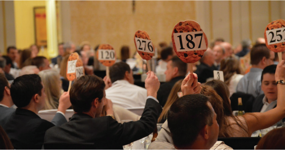
Thank you to the many Fund The Need donors who raised their “cookie paddles” at the Annual Dinner Auction in record numbers.