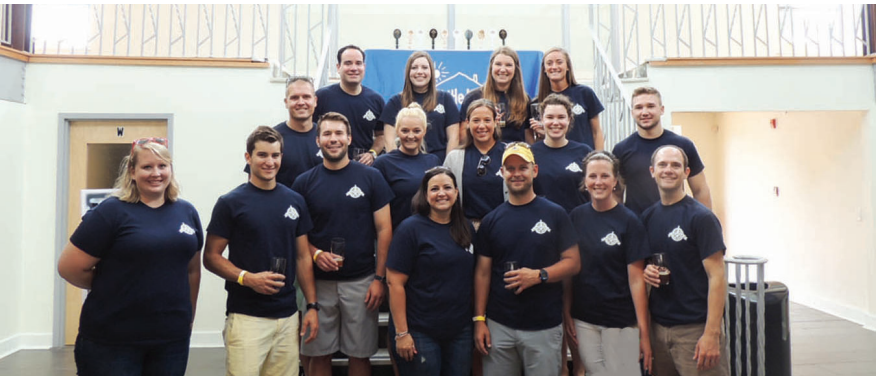
The Home Brew Fest Committee at The Majorette.